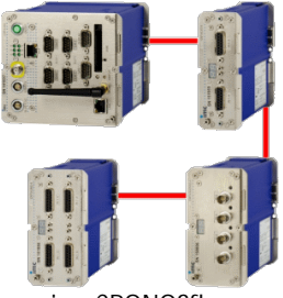
imc CRONOSflex distributed system

Depending on the housing variant, a basic unit with up to five application modules can be configured.