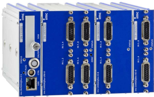
imc CANSASflex modules connected (Click-mechanism) in a block with imc BUSDAQflex Logger (left)