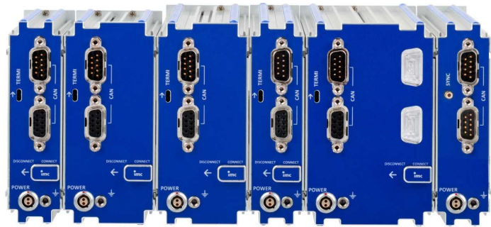
rear view of this block: CAN, Power supply, Terminator, Locking slider