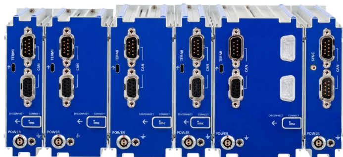
rear view of this block: CAN, Power supply, Terminator, Locking slider