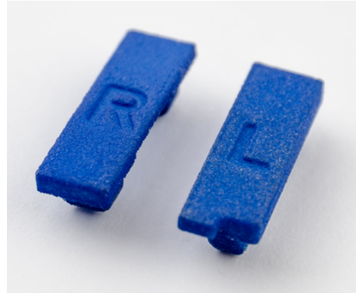
set consisting of left and right protective cover