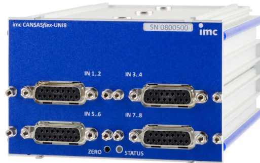
imc CANSASflex-DCB8 (Fig. similar)

For the supply of external sensors and bridge measurement a sensor supply with adjustable voltages 2.5 V to 24 V is included.