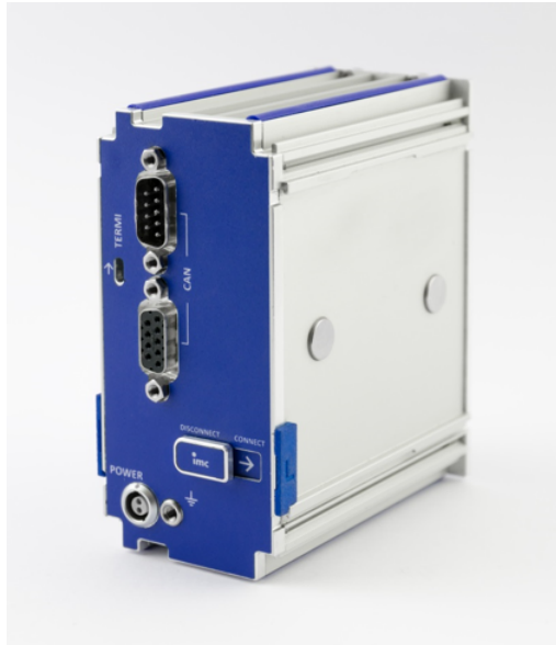
protective cover left (labeled with "L")