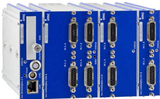
imc CANSASflex modules connected (Click-mechanism) in a block with imc BUSDAQflex Logger (left)