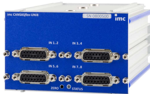
imc CANSASflex-DCB8 (Fig. similar)

For the supply of external sensors and bridge measurement a sensor supply with adjustable voltages 2.5 V to 24 V is included.