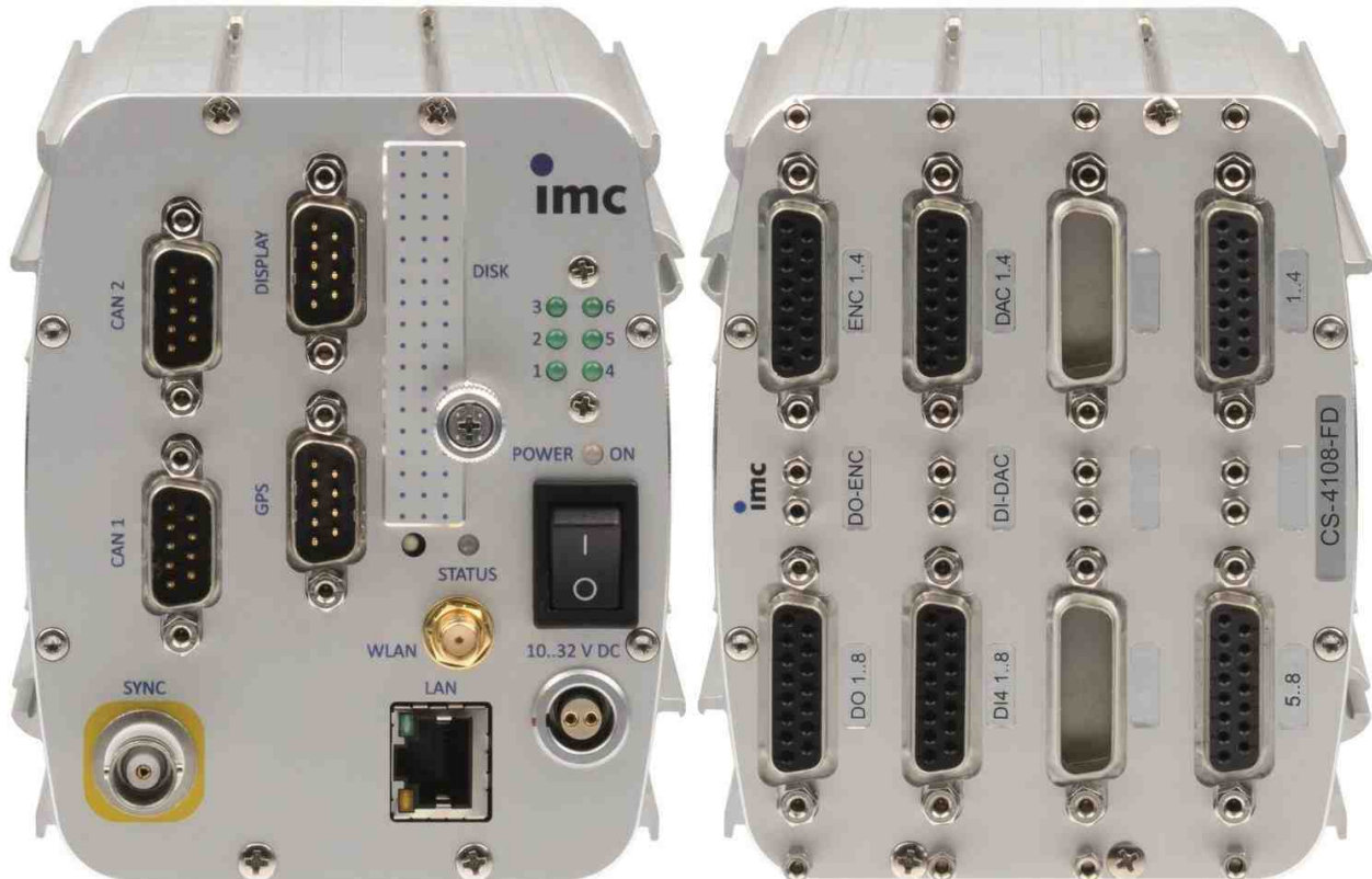
device type: CS-4108-FD, 8 analog measurement inputs

Compact and intelligent measurement system with isolated inputs