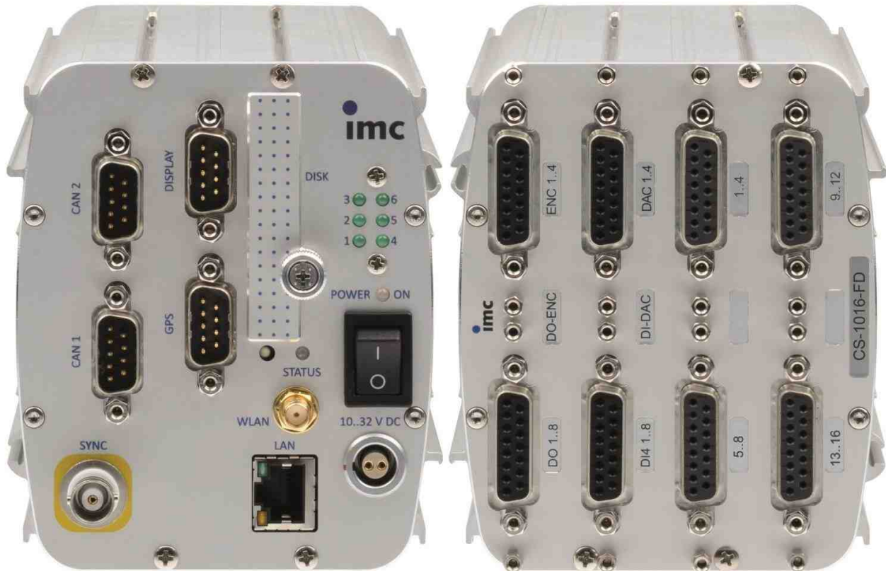
device type: CS-1016-FD (Fig. similar), 16 analog measurement inputs

Compact, intelligent and extensively equipped measurement system for voltage measurements