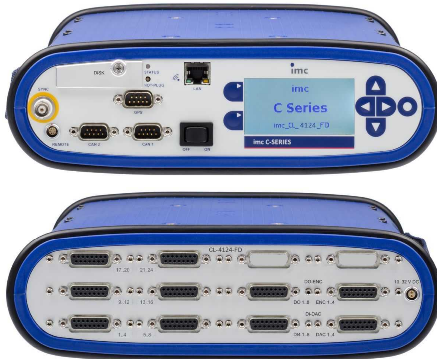
device type: CL-4124-FD, 24 analog measurement inputs

Compact and intelligent measurement system with isolated inputs